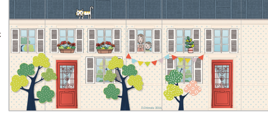
Fold and glue around the box.

©Delphine Doreau 2014. ALL RIGHTS RESERVED. Personnal use only. No commercial use allowed